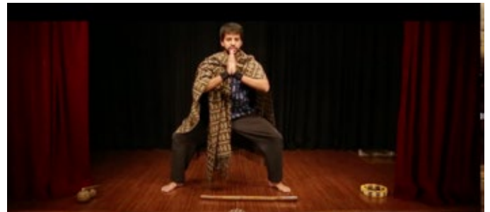
India Season @ Edinburgh 2-28 August