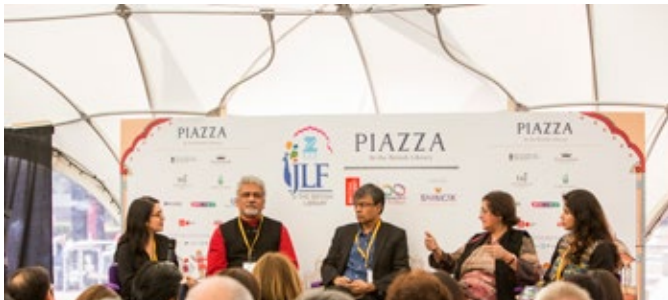
ZEE JLF @ The British Library 20-21 May | London