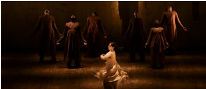
Festival of Dance & Theatre 20 September-26 November London | Birmingham | Edinburgh | Glasgow