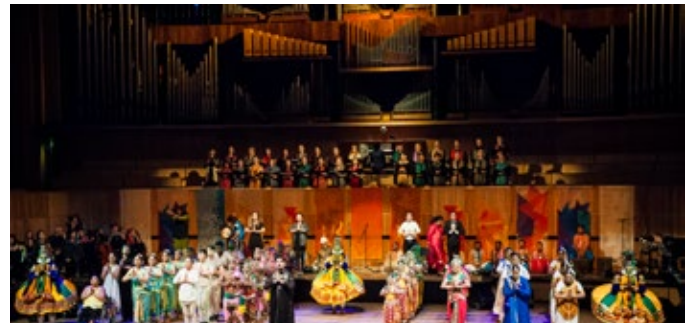
Independence Gala 4 October | Southbank Centre, London