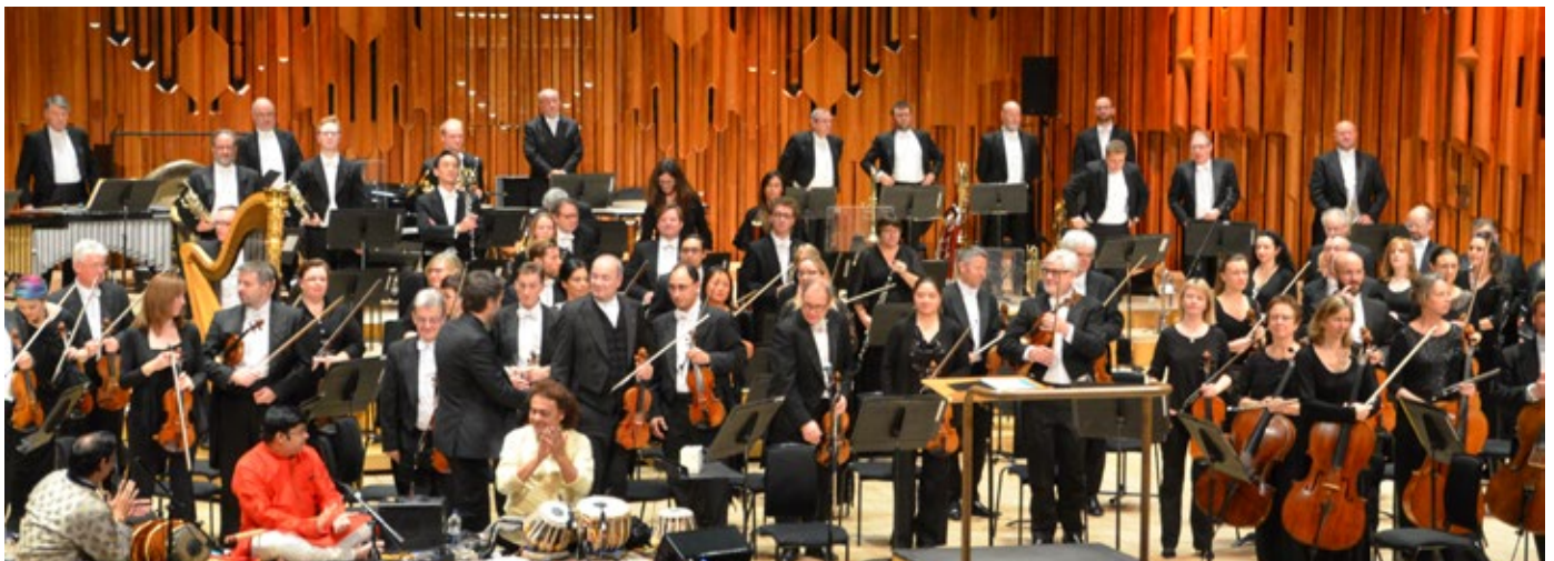
Bharat Symphony 28 November | Barbican Concert Hall, London